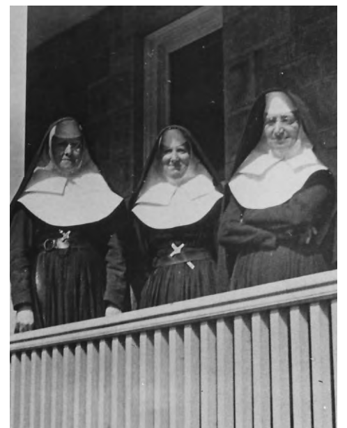
Nuns on hospital porch, circa 1897

We have scheduled guided tours of Cedar Hills Cemetery, Main Street