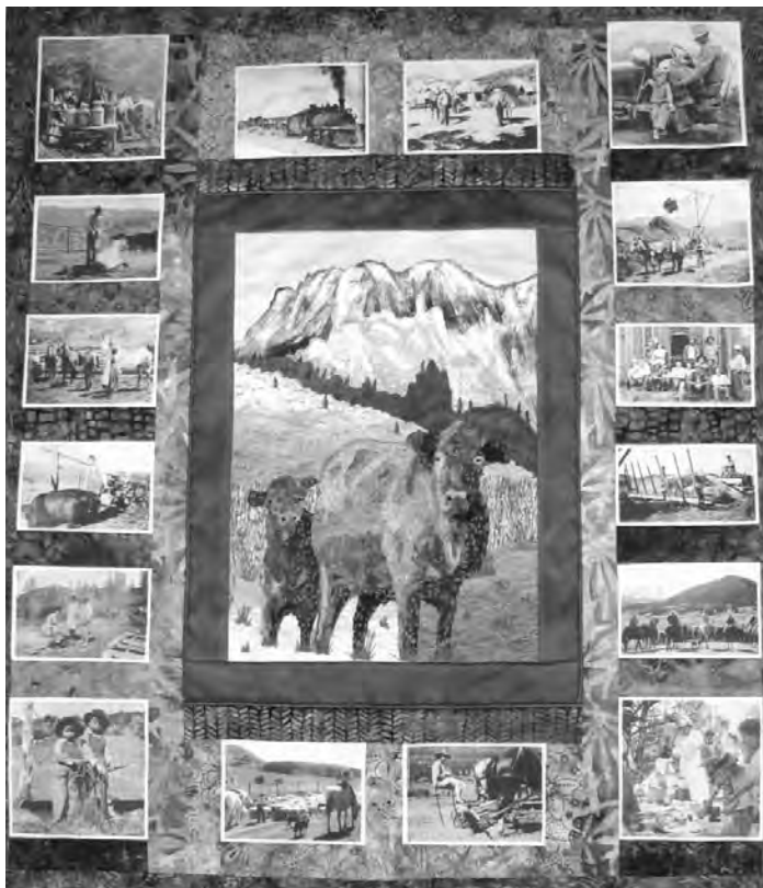
The 2012 Raffle Quilt: High Country Ranching

Entitled "High Country Ranching," the quilt features a center panel based on the pastel, "Elk Meadows Mother and Son," by Ridgway artist Floyd Day. The pastoral scene of cow and calf is surrounded by 16 vintage sepia-tone ranching photos from the collections of the OCHS and the Ridgway Library.